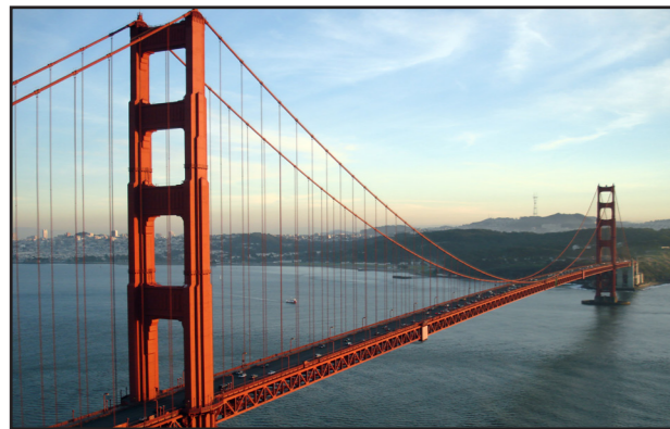
Golden Gate Bridge – San Francisco